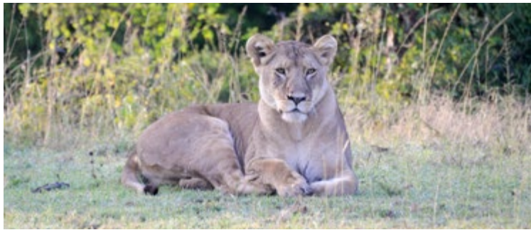
Fig Tree dispersing female

A lone female from the Fig Tree pride has been nomadic ever since she left her pride. She has been seen roaming vast parts of the Reserve before showing up in Ol Kinyei Conservancy.