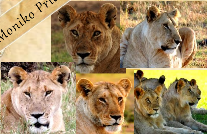
From Above: Zurura (F5), Yieyo (F4), Ngasioki, (F2) Timanoi (F3) and the subs.

Originally there was 6 Moniko adult core females. They supposedly have 13 cubs though this pride have not been seen for a long time since Dec 2015 until later in April when Zurura emerged from Nyumbu valley with the 6 sub adult females and 2 Okiombo males. 4 of the Adult females are always seen together and Zurura has been taking care of the 6, now 3 years old, sub-adult females for a long time. One sub adult female was speared in 2015. The remaining adult female called Leila disappeared and is presumed dead. The 4 Moniko adult and the 6 sub-adult females are currently residing in Naboisho Conservancy, together with the Olkiombo males from MMNR. These males have been seen mating with some of the Moniko sub-adults.